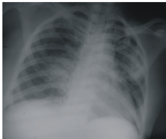
Figure 4 Inhomogeneous opacities, with cystic components, in both lung fields suspected to be due to PCP. There was response to antimicrobial therapy.