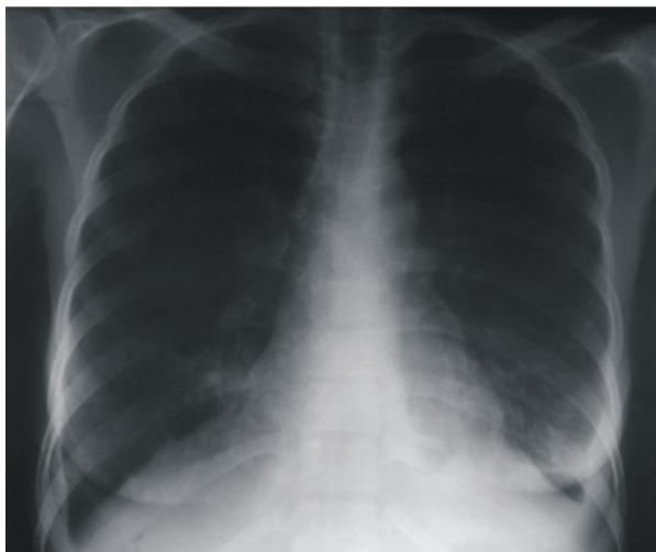
Figure 5 Bilaterally symmetrical alveolar densities, possible with adenopathy, in a patient with suspected to have pneumocystis carinii pneumonia. →